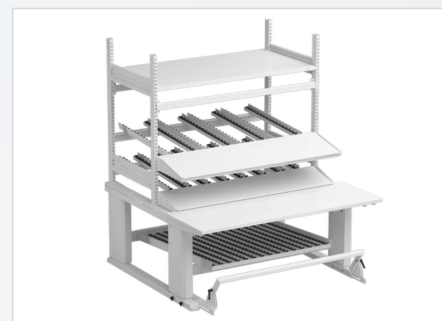
Examples of custom-made solutions for in-house logistics